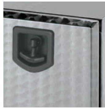
BAWER 40 with Europlex lock