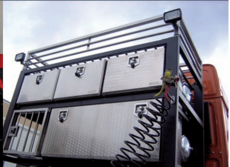
Example of fitting on retrocab storage box structure.