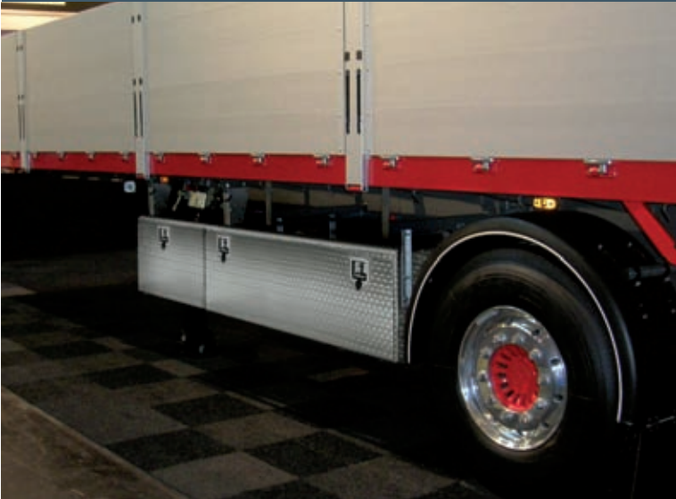
Semi trailer equipped with BAWER 45 DUO toolbox + BAWER 45 MONO toolbox.