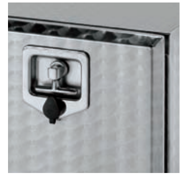
BAWER 45 with Euroinox lock